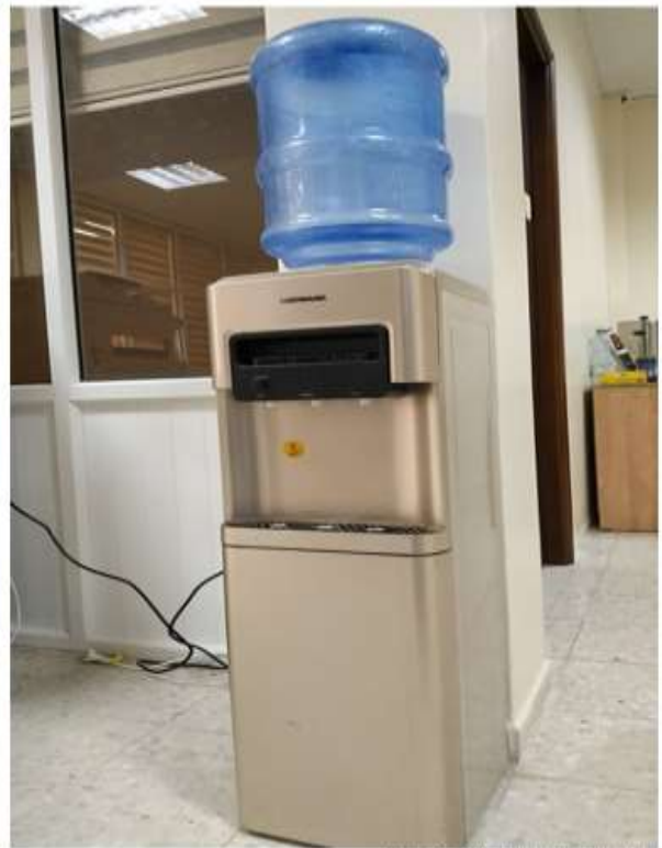
Example of Free Water Drinking at the University